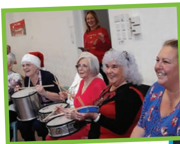
Samba drumming in Tullibody

The Get-Togethers take place three times a month in Alloa, Alva and Tullibody. For more details, please turn to the back page.