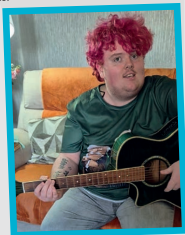
Young Adult Carer accessing their 'self-care' through music

We held a stall at the 'Welcome Week' at Forth Valley College, talking to students and networking. We saw a rise in enquiries from college staff after raising awareness of our project. Next quarter, we will be holding monthly drop-ins at all 3 campuses and meeting with support and guidance staff regularly. We also look forward to working together with their enhanced transition programme in the summer.