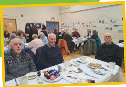
Delicious lunch in Alloa