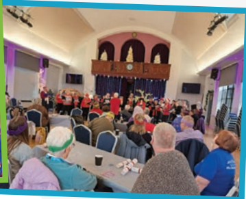
Renaissance Choir's visit in Alva